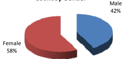
Fall 2007 Int'l Students Unduplicated Count by Gender