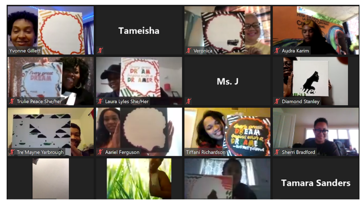
Village Vibes Paint Night - February 16, 2021