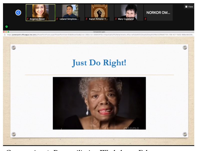
Compassion & Reconciliation Workshop - February 5, 2021